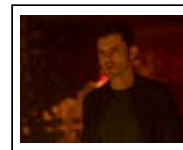
A key player in the imperial court with ties to House Atreides