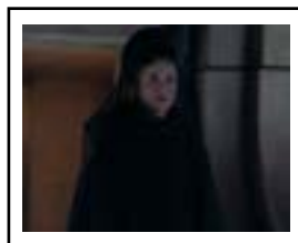
The visionary leader who shapes the future of the Sisterhood