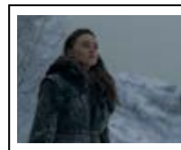
The ambitious young acolyte who rises to power