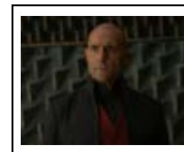
The ruler of the fledgling Imperium